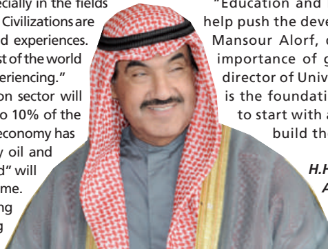
H.H. Sheikh Nasser Al-Mohammed Al-Sabah, Prime Minister of Kuwait

Hand in hand with the country's vast oil wealth, the KDP should set Kuwait on the right path to a more sustainable economic future.