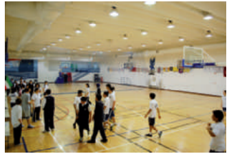
Universal American School (UAS)