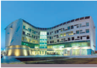
Dasman Diabetes Institute