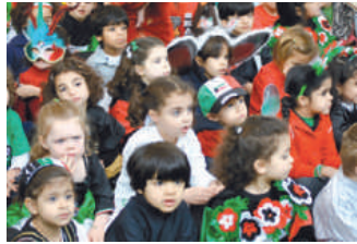
American School of Kuwait (ASK)