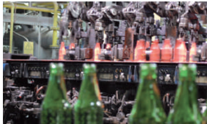
Gulf Glass Manufacturing Co. is an industry leader in the non-oil sector.

Other companies, such as Gulf Glass Manufacturing Company (GGMC), do require more physical space for the company to grow. This is easier said than done, since the government owns and holds 87% of the land.