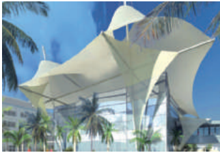
Sabah Al-Salem University City