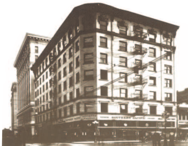
GROSSE BUILDING Occidental's first office