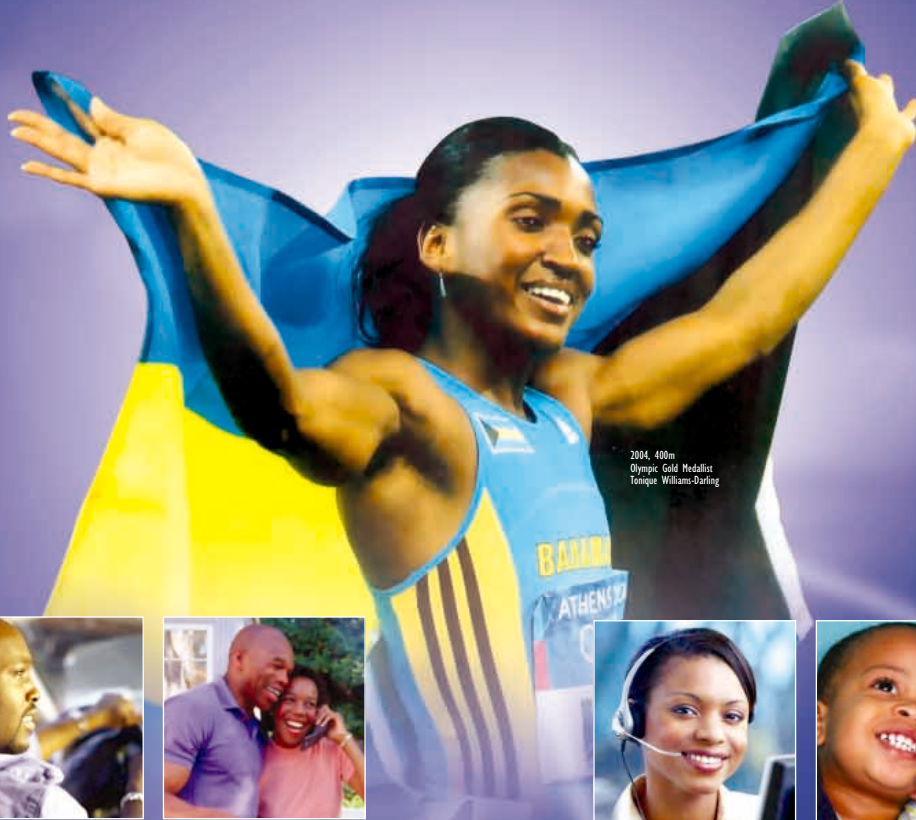
2004, 400m Olympic Gold Medalist Tonique Williams-Darling