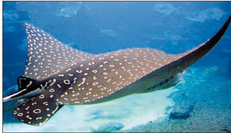
Crystal clear waters are full of aquatic life

The pursuit of excellence is certainly applicable in the financial services sector to what was the first truly privately Bahamian-owned institution. Montaque Capital Partners and Montaque Corporate Partners, jointly referred to as MCP2, are the operational successors to Montaque Securities International (MSI), established in 1993 as a